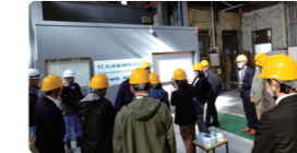
An inspection tour

Through study sessions and inspection tours, we share the latest information on topics related to resource recycling, such as the circular economy and social trends and advancements geared towards the formation of a sound material-cycle society. EPOC and our subcommittee members also practice self and mutual improvement to further strengthen our partnerships.