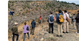
An inspection tour

We support future initiatives from our member companies by holding seminars, research sessions and inspection tours on initiatives such as those aimed at understanding and reducing the impact of all corporate activities on the ecosystem, as well as those related to sustainable use of the benefits to be gained from the ecosystem.