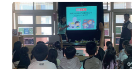
Environmental talk given by corporate member at a school

In order to support environmental awareness and environmental education of youth, particularly elementary and junior high school students, we provide practical, activity-oriented environmental lectures using the educational tools and facilities of our member companies, and we engage in a wide variety of environmental awareness activities in cooperation with the government and other organizations.