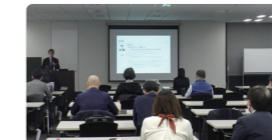
A seminar co-sponsored by the Environmental Management Subcommittee

We are deepening our study of environmental regulations and trends overseas in order to share highly efficacious information about their impact on EPOC and beyond, as well as key points for dealing with them. Our goal is to contribute to our members' overseas activities and business development through collaboration with each subcommittee, team, activities planning division and member to plan seminars, study sessions, discussion forums, exchange meetings with overseas trainees and other such events related to overseas issues.