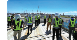
An inspection tour

By researching current social trends toward achieving carbon-neutrality and innovative initiatives related to hydrogen and energy conservation, and by communicating wide-ranging case studies and information about innovative technology such as energy conservation technology that transcends the boundaries of business categories and industries, we aim to improve each member company and promote mutual exchange and cooperation.