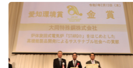
2025 Aichi Environmental Award Ceremony

At the Aichi Environmental Award event hosted by Aichi Prefecture, Aichi Prefecture and the Chunichi Shimbun jointly presented awards for case studies of innovative and effective "technologies and projects" and "activities and education" carried out by companies and organizations. These awards provided an opportunity for environmental activities through communication and information dissemination within the community, including non-member companies.