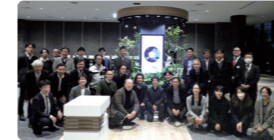
A study session at one of our subcommittee participant companies

We provide member companies with information useful in their work with environmental management and administration, such as societal movements and laws and regulations related to environmental issues, technological information, and case examples from other companies through seminars and inspections. Study group meetings are also held by subcommittee members at their own places of study.