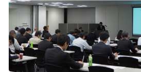
Seminar on leading environmental management

We provide member companies with information useful in their work with environmental management and administration, such as societal movements and laws and regulations related to environmental issues, technological information, and case examples from other companies through seminars and inspections. Study group meetings are also held by subcommittee members at their own places of study.