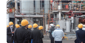
A local workshop

By researching current social trends toward achieving carbon-neutrality and innovative initiatives related to hydrogen and energy conservation, and by communicating wide-ranging case studies and information about innovative technology such as energy conservation technology that transcends the boundaries of business categories and industries, we aim to improve each member company and promote mutual exchange and cooperation.