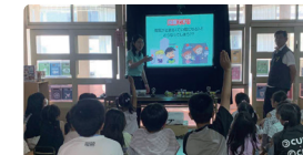
Environmental talk given by corporate member at a school

In order to support environmental awareness and environmental education of youth, particularly elementary and junior high school students, we provide practical, activity-oriented environmental lectures using the educational tools and facilities of our member companies, and we engage in a wide variety of environmental awareness activities in cooperation with the government and other organizations.