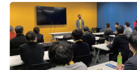
A local workshop

We continue to study and deepen our understanding of overseas environmental regulations and trends, and we disseminate highly effective information on their impact as well as preventive measures both within and outside EPOC. Our goal is to contribute to the overseas activities and business development of our members through the planning of international events (seminars, study sessions, opinion exchange meetings, and so on) in cooperation with each subcommittee/team and their planning activities.