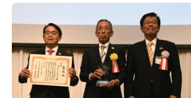
2024 Aichi Environmental Award Ceremony

At the Aichi Environmental Award event hosted by Aichi Prefecture, Aichi Prefecture and the Chunichi Shimbun jointly presented awards for case studies of innovative and effective "technologies and projects" and "activities and education" carried out by companies and organizations. These awards provided an opportunity for environmental activities through communication and information dissemination within the community, including non-member companies.