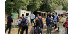
Inspection tour at a certified natural symbiosis site

We support the future initiatives of our corporate members by examining case studies and offering support programs. The initiatives cover all corporate activities with a focus on understanding the impact on the ecosystem, measures for reducing that impact and other corporate initiatives that sustainably use the benefits provided by the ecosystem.