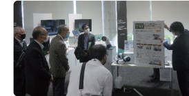
Tour to company that received an Aichi Environmental Award

Toward a circular economy and recycling oriented society, we share the latest information on resource recycling, including the latest social trends and advanced case studies. We also further strengthen self and mutual study and the partnership of EPOC and subcommittee members.